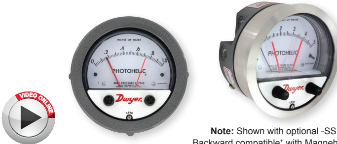
Note: Shown with optional -SS bezel. Backward compatible* with Magnehelic® gage.

Combines Differential Pressure Gage with Low/High Set-Points, Compact Size